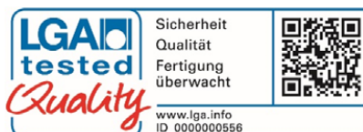
LGA tested Quality