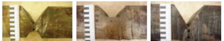
Figure 1: Intermediate Inspection at Preheat Temperature